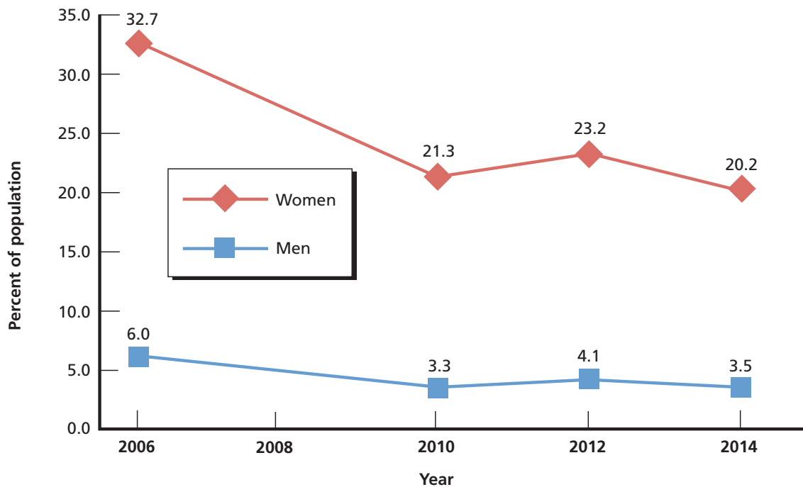
Figure 2 Estimated Percentages of Active-Duty Men and Women Who Experienced Sexual Harassment in the Past Year, as Defined by the WGRA Methodology, 2006–2014

Note: 2006 estimates are for calendar year 2006. Estimates for 2010, 2012, and 2014 are for a time period closer to the fiscal year.